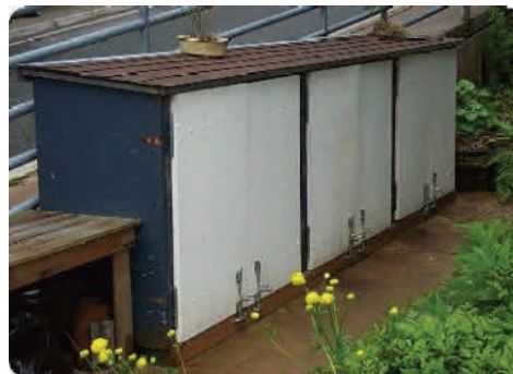
Home constructed Garbage Enclosure with metal seams and heavy duty handles