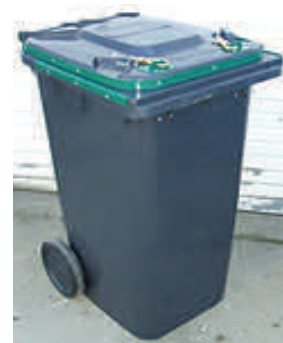
Example Bear Resistant Container with reinforced lockable top