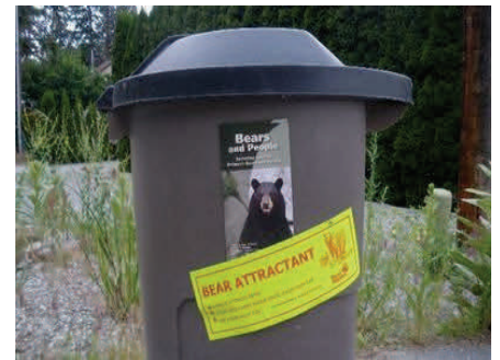
Information sticker on garbage can

Yes! Since July 1st, 2011 residents have been required not to place garbage out over night. As a result, streets are tidier, fewer incidents of bear sightings or damage have been reported, and calls to the Conservation Officer Service RAPP Line has declined to zero over the summer. When Fall brings bears back into our neighbourhoods to fish the creek, the bears will have no reason to loiter in the community. RAPP Line # 1-877-952-7277