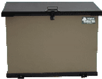
Example 'TyeDee Bin' pre-made Garbage Enclosure