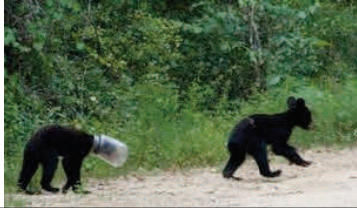
Cub with tub stuck on head unable to eat or drink